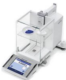
METTLER TOLEDO microbalance XS205DU

Weight measurements are made after permeabilization, eliminating variations in water contents due to osmotic stress, allowing for elimination of connective tissue during mechanical separation before weight measurement, and for partitioning of subsamples of similar wet weight.